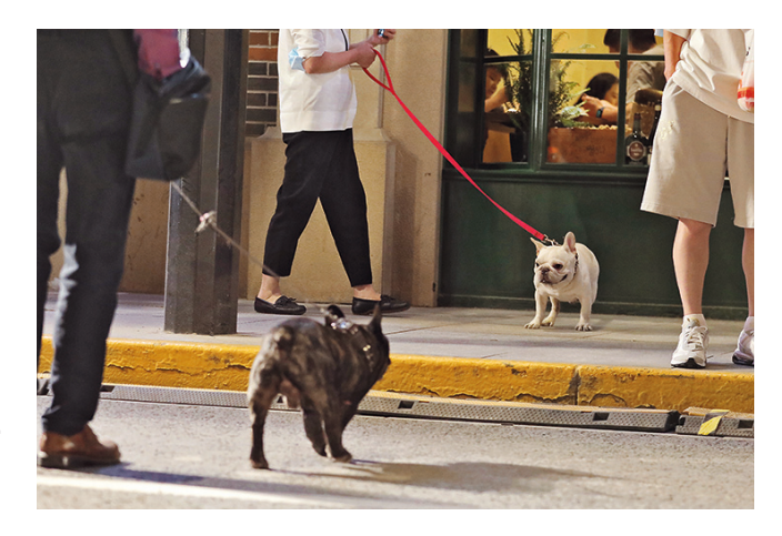
Residents walk their dogs on the street.