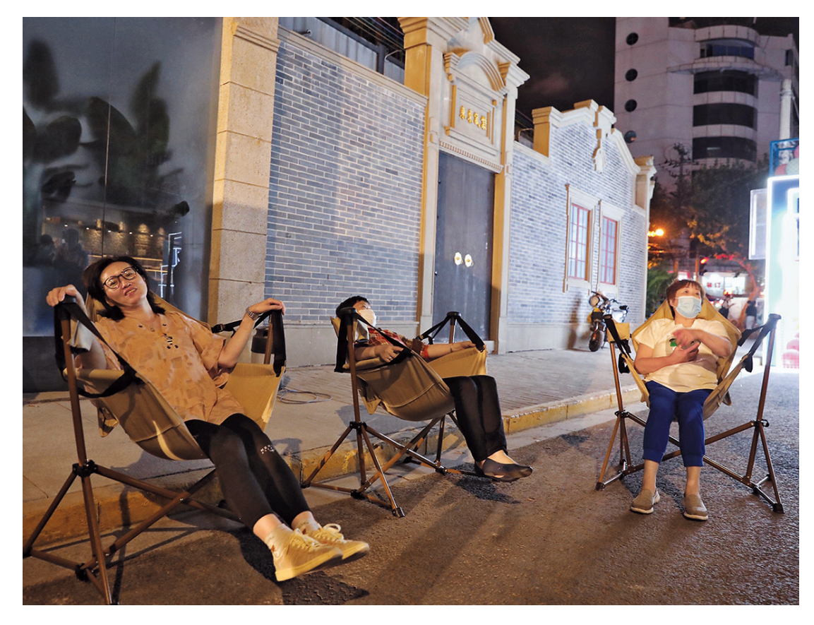
Nearby residents relax on chairs, considering the street to be their own backdoor garden — at least on the weekends.

Crowds of people walk on Maoming Road N., a new pedestrian street in Shanghai, last Saturday.