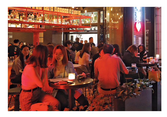
Patrons have a good time at a bar on the new weekend pedestrian street.